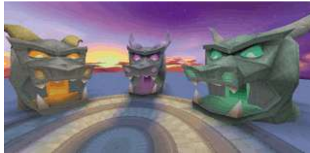
Figure 5. Using color to differentiate or "landmark" areas can prevent players from getting too lost or confused.

Examine each level and make sure that it works on its own and also supports the overall gestalt of the game. The textures and shaders should strengthen the settings, the settings should strengthen the game play, and the player, at a glance, should be able to see what's important what's simply eye candy. It's constantly a surprise to me, and everyone here at Insomniac, how powerful a role color plays in pulling all these elements together, or in tearing them apart.