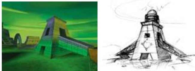
Figure 9. Specific pieces of architecture proved to be one of the most effective ways of creating a landmark. From initial concept to the finished play field, we designed unique areas into the game to help players maintain their bearings.

Use landmarks whenever possible. A landmark is a unique structure or geographical feature that distinguishes one area from another, which gives the player a reference point in the level. Specific pieces of architecture, such as bridges, castles, fortresses, or other buildings that had a strong presence and appeared only once in a particular level proved to be the most effective landmarks (Figure 9). To enhance the uniqueness of a landmark, we added specific natural features around it, such as waterfalls, rivers, rock formations, or trees.