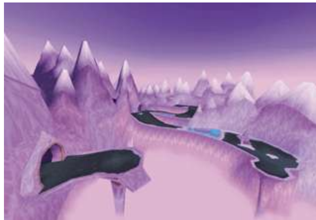
Figure 7. To give each of Spyro's six worlds a unique first impression, we often employed a dramatic three dimensional panorama. This opening scene of the Magic Crafters world established its basic characteristics and created a memorable view.

each world even more, we designed a dramatic three-dimensional panorama at the start of each world to give the player a memorable first impression (Figure 7).