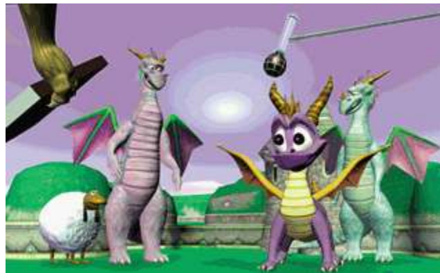
Figure 6. Insomniac Games' production design for Spyro the Dragon created a distinctive look for a new character and game. Spyro's medieval fantasy world was composed with bright colors, soft decorative textures, and a cast of fairy tale characters.

Use soft textures and simple decorative motifs. Our early tests showed that the Playstation's display sharpened textures to the point where highly detailed artwork degenerated into distracting visual noise. By avoiding hard outlines, high contrast, and too much detail in individual tiles, we were able to create a soft atmospheric quality which was aesthetically pleasing, yet not distracting to game play.