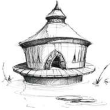
Figure 10. We found that solving a visual problem on paper was much faster than using a computer. Modifications to an area during the design phase could be completed in a matter of hours instead of the days or even weeks it took to implement the finished design on the computer.