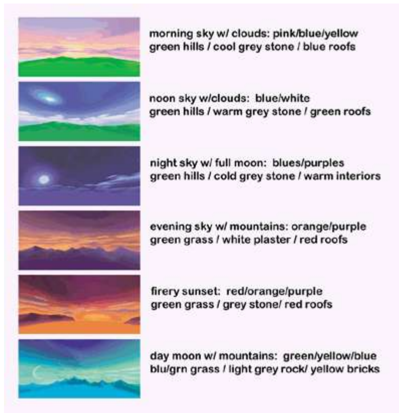
Figure 2. During the development of Spyro , a white board was used to display all 30 levels and their respective colors. It went through many changes before the end of the project.

One way to check the overall state of your "gallery" - the color continuity between game levels - is to view screenshots or test swatches from each of the levels side by side, as if they were a color wheel or contiguous screenshots in a consumer game magazine. Decide if each individual level's look supports and strengthens the others. If not, rework the colors in one or more of the levels. More often than not, it doesn't take much of a change to find that balance if you catch the problem early. With Spyro , as soon as we had a rough design document with its specified worlds, we put up a white board in the art room with a brief description of the sky and the core palette for each of the levels. Further along in the development process, small color print outs of screenshots augmented the white board (see Figure 2).