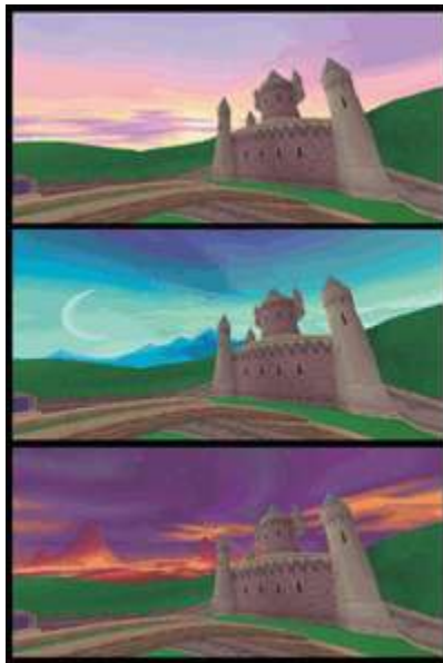
Figure 3. By experimenting with different skies, the nature and emotion of an entire world can be radically altered.

Recently, I designed a sky that was one of my all-time favorites. It was a misty green sky, filled with wispy clouds and distant planets. It complemented the world it was designed for, but something wasn't right. While beautiful, it also evoked negative reactions from people. Finally someone pointed out that it looked poisonous. That would have been great if that was what we intended, but this particular world wasn't supposed to be poisonous; threatening yes, but not poisonous. In the end, we went with a more naturally-colored night sky, which contained several moons and a haunting red glow on the horizon.