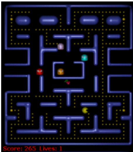
Figure 1. PacMan and all of its clones are still very popular games.

When Atari produced its first game console in the seventies it was not very popular. This changed drastically when the game Space Invader was created and bundled with the console. Within a short period of time Atari sold a huge number of consoles. The same thing happened when Pacman was produced. And for the Nintendo Game Boy Tetris was the absolute winner. Why are these games so special that they mean the difference between success and failure of the devices they were created for?