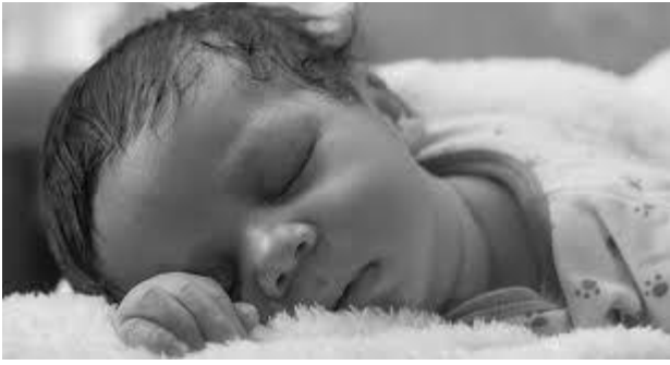
Light against dark informal balance