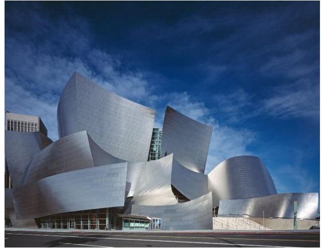
Light against dark informal balance